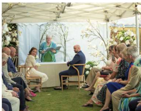
in a private garden

Many couples and their guests find such a degree of personalisation heartwarming and guests always tell me how much they loved learning something about the couple and hearing stories from them, or others, about how the relationship developed.