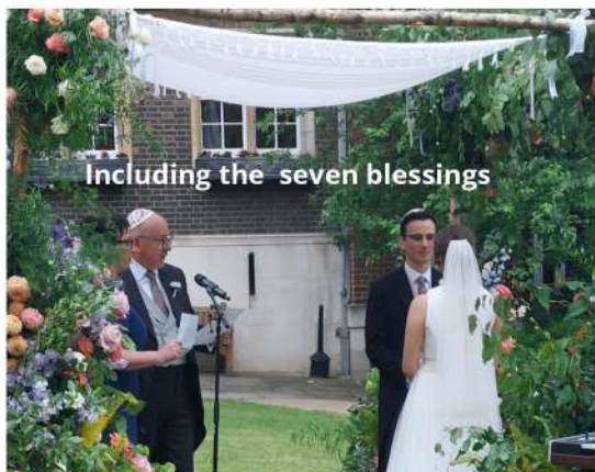
Including the seven blessings

People have sung, read their own poetry and created beautiful sand ceremonies and handfasting as a special moment and of course, the writing of the vows is incredibly special. I always carry tissues!