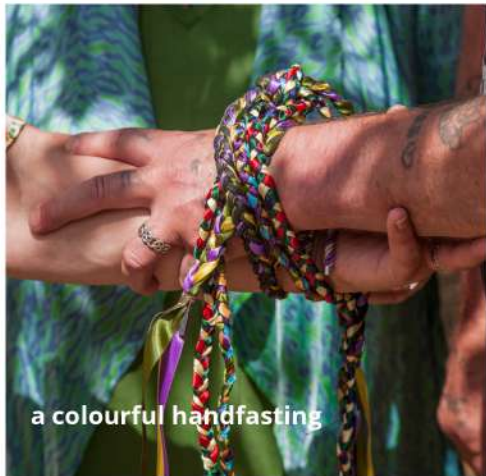
a colourful handfasting