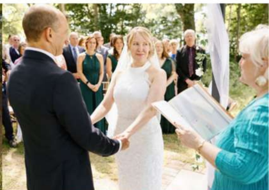
woodland section of venue