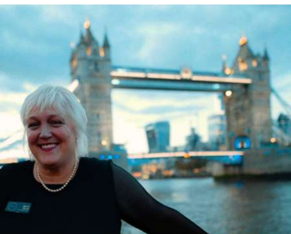
on a boat on the river Thames