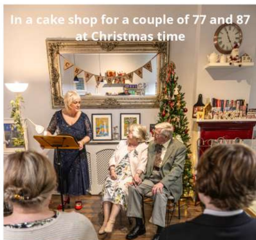
In a cake shop for a couple of 77 and 87 at Christmas time